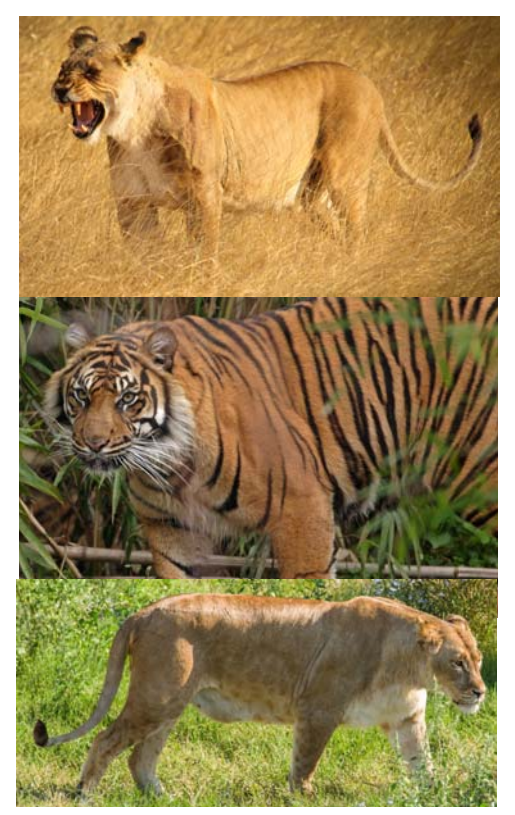
These are pictures of a lion (top), tiger (middle), and liger (bottom).

How different was your "evolved" animal from your original animal? Depending on the choices you made and how many times you repeated step 3, your "evolved" animal might be very different from your original animal, or it might be very similar but with longer legs, thicker legs, bigger ears, etc. The key to the activity was in doing something that would make the animal more likely to survive. Natural selection will only select those kinds of changes.