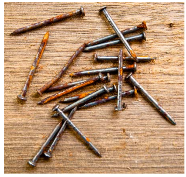
These nails are in various stages of rusting.

You should have noticed a huge difference between the glasses when you looked at them in step 9. The glass that contained vinegar and water should have looked pretty much the same as it did in step 7. However, the glass that contained vinegar and hydrogen peroxide should have been red or orange. What caused the mixture in that glass to be a different color? Some of the steel wool rusted, and the rust mixed with the liquid in the glass, giving it a red color.