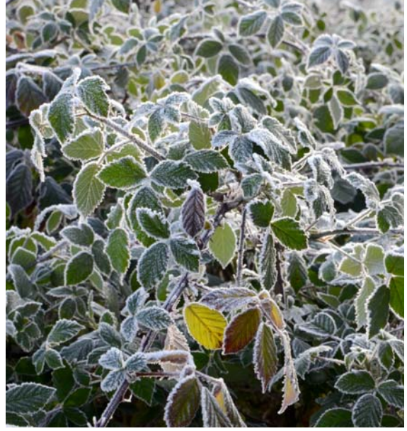
The frost on these leaves tells you that the leaves are very cold.

This tells us how dew forms. When the grass and flowers are cool enough, water vapor in the surrounding air condenses, forming water droplets on the grass and flowers. Of course, the more water vapor that is in the air, the more dew can form. This is, in fact, a very important factor in the formation of dew. Dew forms when the temperature reaches a certain value, which is called the dew point . However, the dew point depends on the amount of water vapor in the air. The more water vapor in the air, the higher the dew point. In other words, if there isn't much water vapor in the air, the temperature doesn't have to get as low in order for dew to form. This is one big reason you don't see dew every cold morning. The temperature might be low, but if the amount of water vapor in the air is also low, the temperature may not be at or below the dew point, so dew will not form.