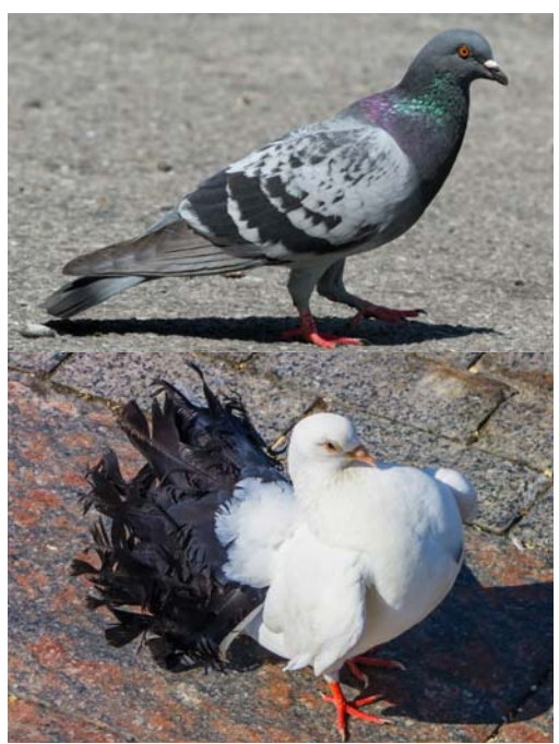
A rock pigeon (top), and one of its descendants, a fantail pigeon (bottom).

One of the more powerful arguments Darwin used to support his idea of evolution by natural selection came from his discussions with people who bred animals for a living. For example, pigeon