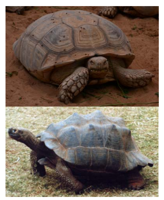
Each of these tortoises comes from a different island in the Galápagos. Notice how different the shapes of their shells are.

Most scientists of Darwin's day would say those tortoises had each been created separately with that particular kind of shell, but that didn't make sense to Darwin. Instead, he suggested that a long time ago, all of those tortoises were the same. However, since each group lived on a different island, they eventually changed to the point where each group was noticeably different from the rest. In other words, he thought that these different groups of tortoises were originally nearly identical, but over time, they evolved to have several differences, such as differently-shaped shells.